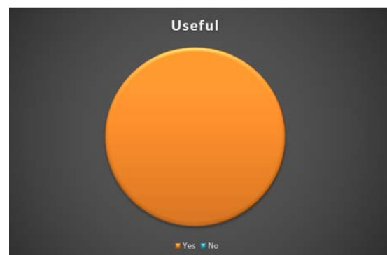
Fig 1: The Percentage of the usage of English in Nursing Subject The second, inputs for the development or reconstruction of English in Nursing Syllabus. The third, the 14 suitable materials to be put in the syllabus of English in Nursing Subject, as follows:

The questionnaire consisted of three main aspects, i.e., the identity of the participants (Name, Position, Name of the institution), questions about the usage of English in Nursing Subject in their working area, opportunity to choose 14 suitable or appropriate learning materials, and inputs regarding the reconstructing English in Nursing Subject syllabus. In this questionnaire, several significant findings were found related to the need's analysis framework, namely as follows: The first, the usage of English in Nursing Subject in their working area. The pie chart showed that 100% of the stakeholders of alumni users agreed about the usage of English in Nursing Subject in their working area.