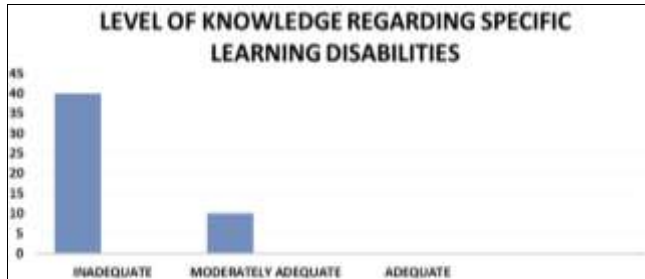
Fig 1: Frequency and percentage distribution of knowledge of teachers regarding SPLD